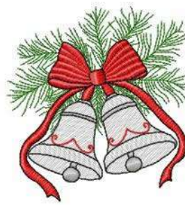
File: MylarChristmasBells05.pes Stitches: 9366 Size: 3.66x3.90 " Size: 93.0x99.1 mm Colors: 6/6 Stops: 5 Stops: 5