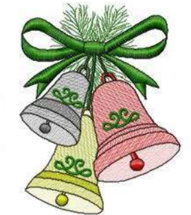
File: MylarChristmasBells12.pes Stitches: 14690 Colors: 10/11 Size: 4.59x6.07 " Stops: 10 Size: 116.7x154.1 mm Stops: 10