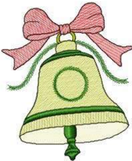
File: MylarChristmasBells10.pes Stitches: 9213 Colors: 7/8 Size: 5.04x6.01 " Stops: 7 Size: 127.9x152.6 mm Stops: 7