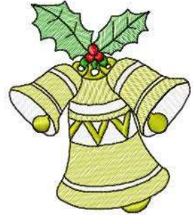
File: MylarChristmasBells03.pes Stitches: 6657 Size: 3.33x3.90 " Size: 84.7x99.1 mm Colors: 6/7 Stops: 6 Stops: 6