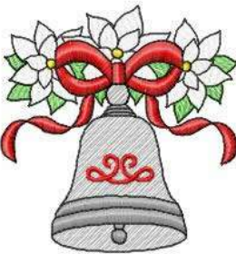
File: MylarChristmasBells07.pes Stitches: 8524 Size: 3.76x3.90 " Size: 95.5x99.1 mm Colors: 7/8 Stops: 7 Stops: 7