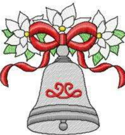
File: MylarChristmasBells07.pes Stitches: 11675 Colors: 7/8 Size: 5.05x5.23 " Stops: 7 Size: 128.3x132.9 mm Stops: 7