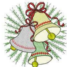
File: MylarChristmasBells09.pes Stitches: 10956 Colors: 9/9 Size: 5.04x5.27 " Stops: 8 Size: 128.0x133.8 mm Stops: 8