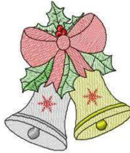
File: MylarChristmasBells02.pes Stitches: 9982 Colors: 7/7 Size: 5.05x5.85 " Stops: 6 Size: 128.2x148.5 mm Stops: 6