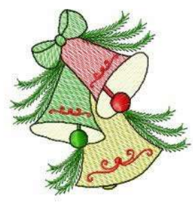
File: MylarChristmasBells06.pes Stitches: 5974 Size: 3.81x3.90 " Size: 96.8x99.0 mm Colors: 8/8 Stops: 7 Stops: 7