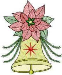
File: MylarChristmasBells01.pes Stitches: 10197 Colors: 8/8 Size: 5.03x6.11 " Stops: 7 Size: 127.8x155.1 mm Stops: 7