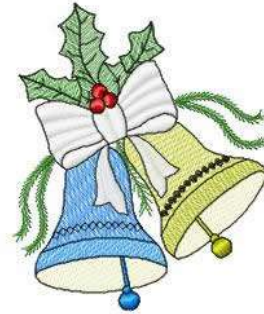
File: MylarChristmasBells08.pes Stitches: 11619 Colors: 9/10 Size: 5.04x6.00 " Stops: 9 Size: 128.0x152.5 mm Stops: 9