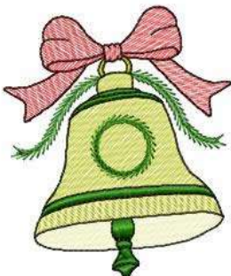
File: MylarChristmasBells10.pes Stitches: 5521 Size: 3.28x3.91 " Size: 83.3x99.3 mm Colors: 7/8 Stops: 7 Stops: 7