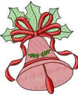
File: MylarChristmasBells04.pes Stitches: 10836 Colors: 6/6 Size: 5.01x5.88 " Stops: 5 Size: 127.3x149.3 mm Stops: 5