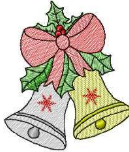
File: MylarChristmasBells02.pes Stitches: 6507 Size: 3.36x3.90 " Size: 85.4x99.1 mm Colors: 7/7 Stops: 6 Stops: 6