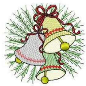
File: MylarChristmasBells09.pes Stitches: 7839 Size: 3.89x3.90 " Size: 98.8x99.0 mm Colors: 9/9 Stops: 8 Stops: 8