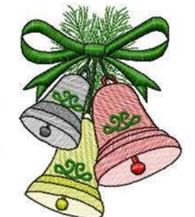
File: MylarChristmasBells12.pes Stitches: 9061 Size: 2.93x3.87 " Size: 74.5x98.3 mm Colors: 10/11 Stops: 10 Stops: 10