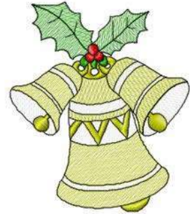
File: MylarChristmasBells03.pes Stitches: 11006 Colors: 6/7 Size: 5.04x5.91 " Stops: 6 Size: 128.1x150.1 mm Stops: 6