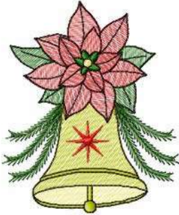
File: MylarChristmasBells01.pes Stitches: 6032 Size: 3.27x3.90 " Size: 83.1x99.0 mm Colors: 8/8 Stops: 7 Stops: 7