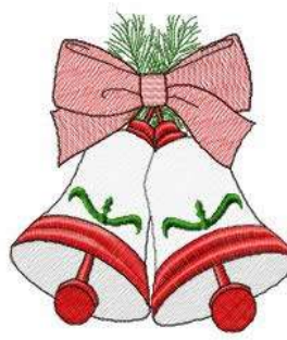
File: MylarChristmasBells11.pes Stitches: 11511 Colors: 6/8 Size: 5.00x5.60 " Stops: 7 Size: 127.1x142.3 mm Stops: 7