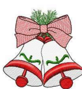
File: MylarChristmasBells11.pes Stitches: 7458 Size: 3.91x3.85 " Size: 99.2x97.9 mm Colors: 6/8 Stops: 7 Stops: 7