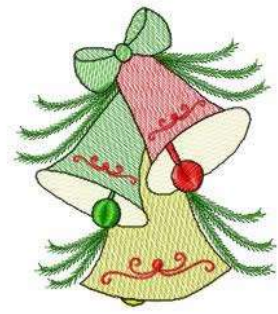
File: MylarChristmasBells06.pes Stitches: 9360 Colors: 8/8 Size: 4.96x5.61 " Stops: 7 Size: 126.0x142.5 mm Stops: 7