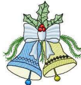
File: MylarChristmasBells08.pes Stitches: 6943 Size: 3.71x3.90 " Size: 94.2x99.1 mm Colors: 10/10 Stops: 9 Stops: 9