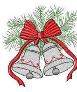
File: MylarChristmasBells05.pes Stitches: 12612 Colors: 6/6 Size: 5.00x5.33 " Stops: 5 Size: 127.0x135.3 mm Stops: 5