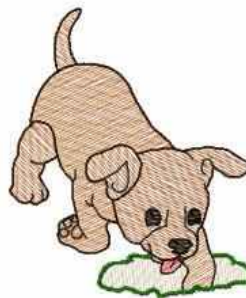
File: Doggy08.pes Stitches: 3963 Size: 3.25x3.88 "