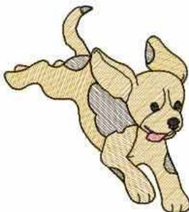
File: Doggy07.pes Stitches: 3879 Size: 3.50x3.91 "