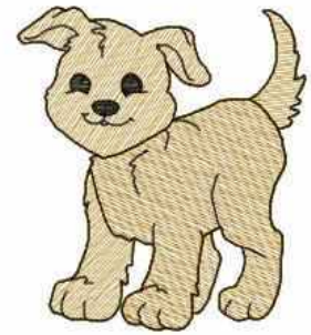
File: Doggy03.pes Stitches: 4661 Size: 3.49x3.91 "