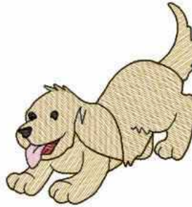
File: Doggy02.pes Stitches: 3843 Size: 3.69x3.90 "