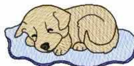
File: Doggy11.pes Stitches: 3321 Size: 3.87x1.86 "