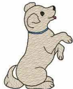
File: Doggy09.pes Stitches: 3196 Size: 3.05x3.90 "