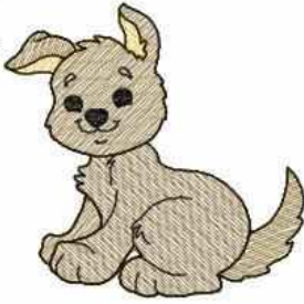
File: Doggy01.pes Stitches: 4018 Size: 3.90x3.83 "