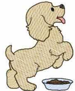
File: Doggy06.pes Stitches: 3907 Size: 2.89x3.83 "