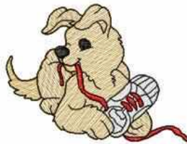
File: Doggy05.pes Stitches: 4401 Size: 3.93x2.94 "