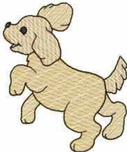
File: Doggy04.pes Stitches: 3481 Size: 3.23x3.90 "