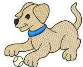
File: Doggy12.pes Stitches: 3982 Size: 3.90x3.30 "