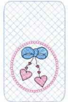
File: ITHQuiltedPurse2-06.pes Stitches: 7596 Size: 157.3x257.3 mm