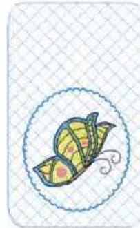
File: ITHQuiltedPurse2-05.pes Stitches: 9463 Size: 157.2x257.2 mm