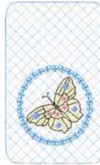
File: ITHQuiltedPurse2-02.pes Stitches: 9391 Size: 157.3x257.3 mm