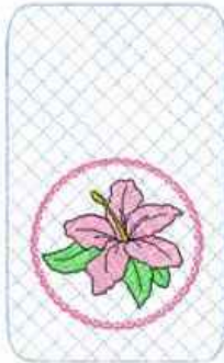
File: ITHQuiltedPurse2-04.pes Stitches: 10470 Size: 157.3x257.3 mm