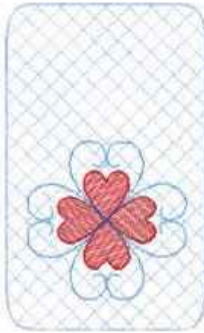
File: ITHQuiltedPurse2-01.pes Stitches: 6121 Size: 157.3x257.3 mm