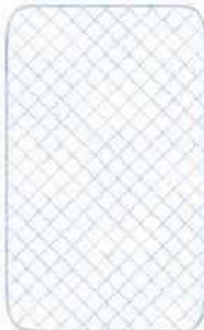
File: JustQuiltedFront6x10.pes Stitches: 2530 Size: 157.3x257.3 mm