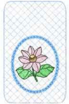
File: ITHQuiltedPurse2-03.pes Stitches: 10251 Size: 157.3x257.3 mm